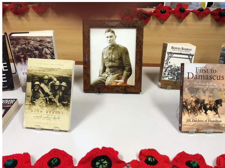
Honouring Anzac Day Display at the Hay Library

Children's Reading: Children's reading and activities held every Tuesday commencing at 10.30am.